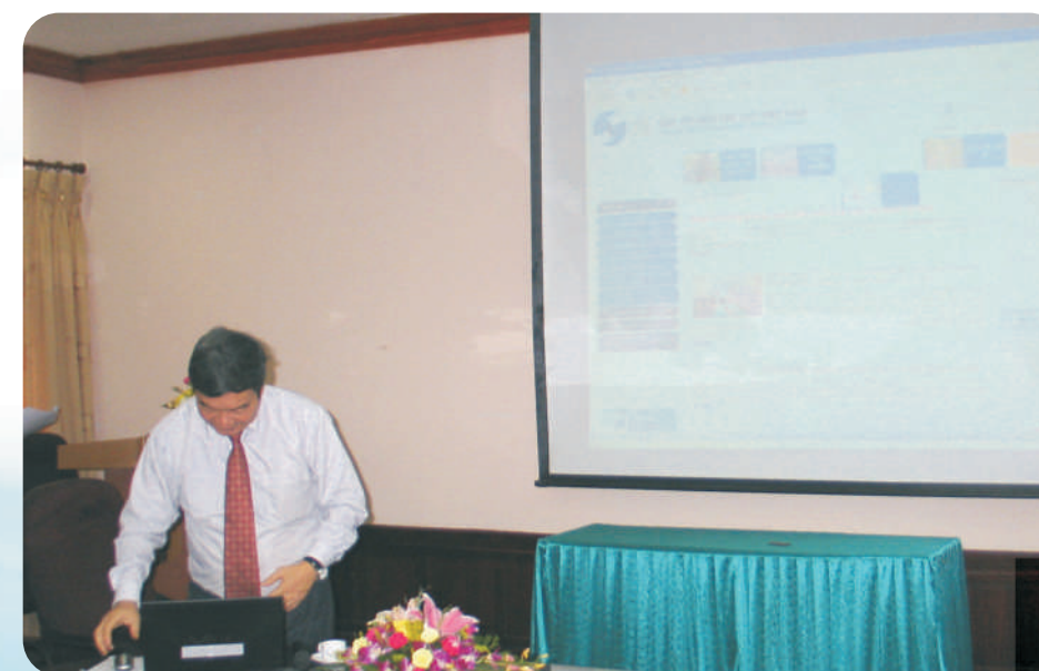
Director General Tran Viet Hung launched the new version of NOIP's website

In addition to the improvement of the database, IT activities were carried out to maximize the effectiveness of the databases and search tools, accordingly saving time for examiners. In line of "under 03 seconds", the system is required to provide feedbacks to all orders by examiners in the shortest time.