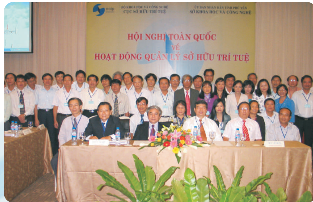
■ 2009 National Conference on management of intellectual property