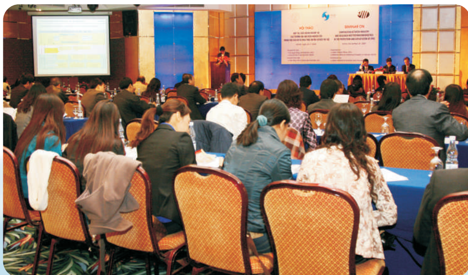
Workshop on "Collaboration between industries and universities/institutions on the protection and exploitation of IPRs"

well understanding about IP for individuals and organizations outside the Office, an example of which was the Training course on IP legislation jointly organized by the NOIP and Faculty of Law, National University of Ha Noi, training course on IP jointly organized with the University of Law of Ho Chi Minh City, training courses on Patent Drafting and on Industrial Design jointly organized with WIPO. In order to develop Viet Nam's IP system, the Office organized many short term courses for IPRs administration and enforcement officials, researchers and enterprises all over the country. The Office carried out trainings on IP for the representatives of Science and Technology abroad, etc. Particularly, with WIPO's assistance, the Office completed preparing infrastructure and necessary conditions for the implementation of online training course on IP.