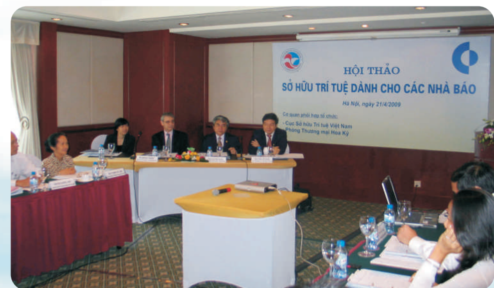
Seminar on “Intellectual Property for Journalists” (April 2009)

In addition to the above-mentioned activities, dissemination on IP has also been consecutively implemented through mass media. Last year, the Gameshow “Flying with Brand” on VTV3 were continuously organized with the professional consultation of the NOIP’s officers; the Program