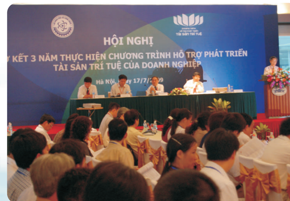
Three-year Reviewing meeting of Program 68 (National Conference Centre, 17 July 2009)