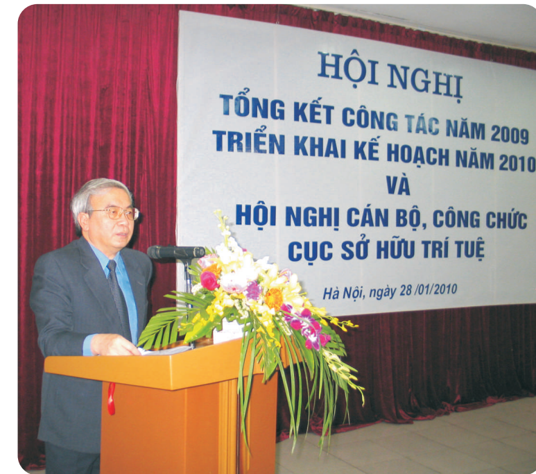
H.E. Minister of Science and Technology Hoang Van Phong at the NOIP's Annual Review Meeting of 2009 (28 January 2010)