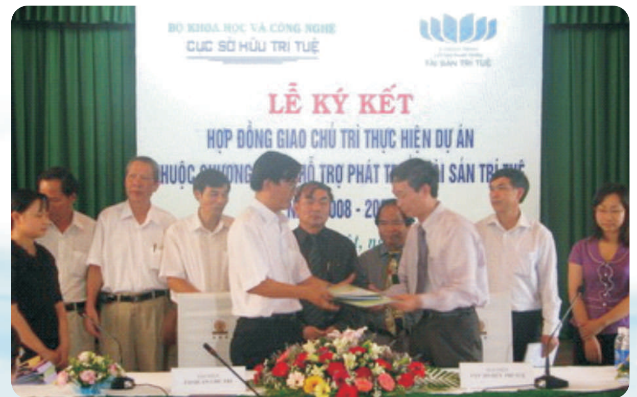
■ Signing Ceremony of Projects Implementation under Program 68 (Buon Ma Thuot, June 2009)