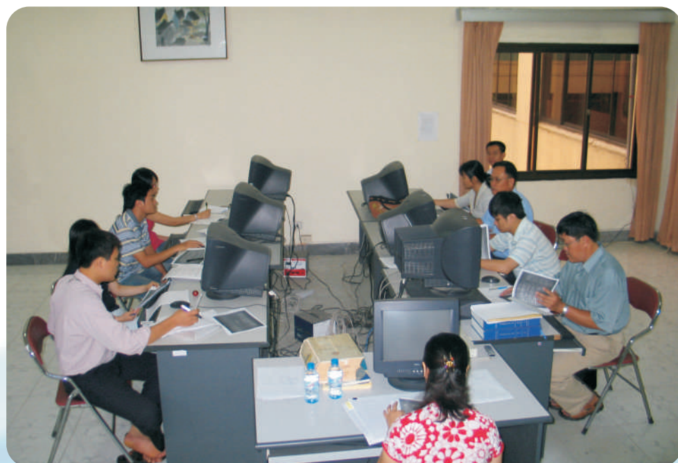
Delegates from Can Tho University in a training session on patent searching at NOIP's IP Centre

Information Center has established IP corner within the IP Library since 2007 to assist users to approach patent information sources in Ha Noi University of Technology, Universities of Da Nang, An Giang and Phu Yen. In 2009, the little library was visited and used by some lecturers and students.