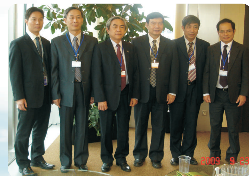
Viet Nam's Delegation attended the 47 th meeting of the WIPO General Assembly in Geneva (2009)