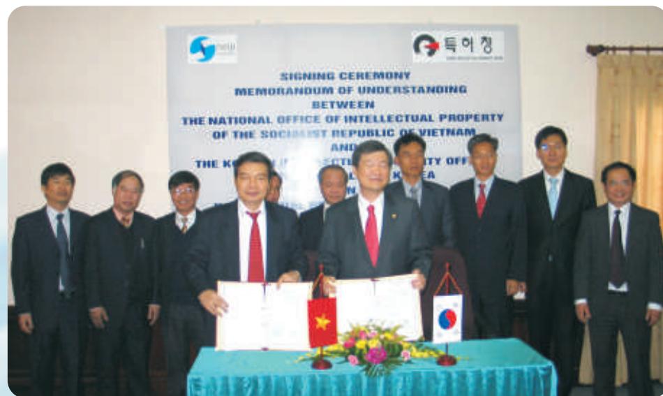
■ KIPO's Delegation headed by Commissioner Jung-Sik at the signing ceremony of MoU on IP cooperation between NOIP and KIPO (NOIP, August 2009)

It could be said that international cooperation activities in 2009 were actively conducted by NOIP with positive achievements that made a significant contribution to the modernization and completion of the IP system as well as affirmation of the country's position in international economic integration and cooperation.