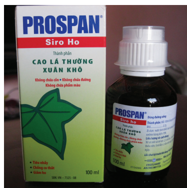
Prior trademarks/ packaging label